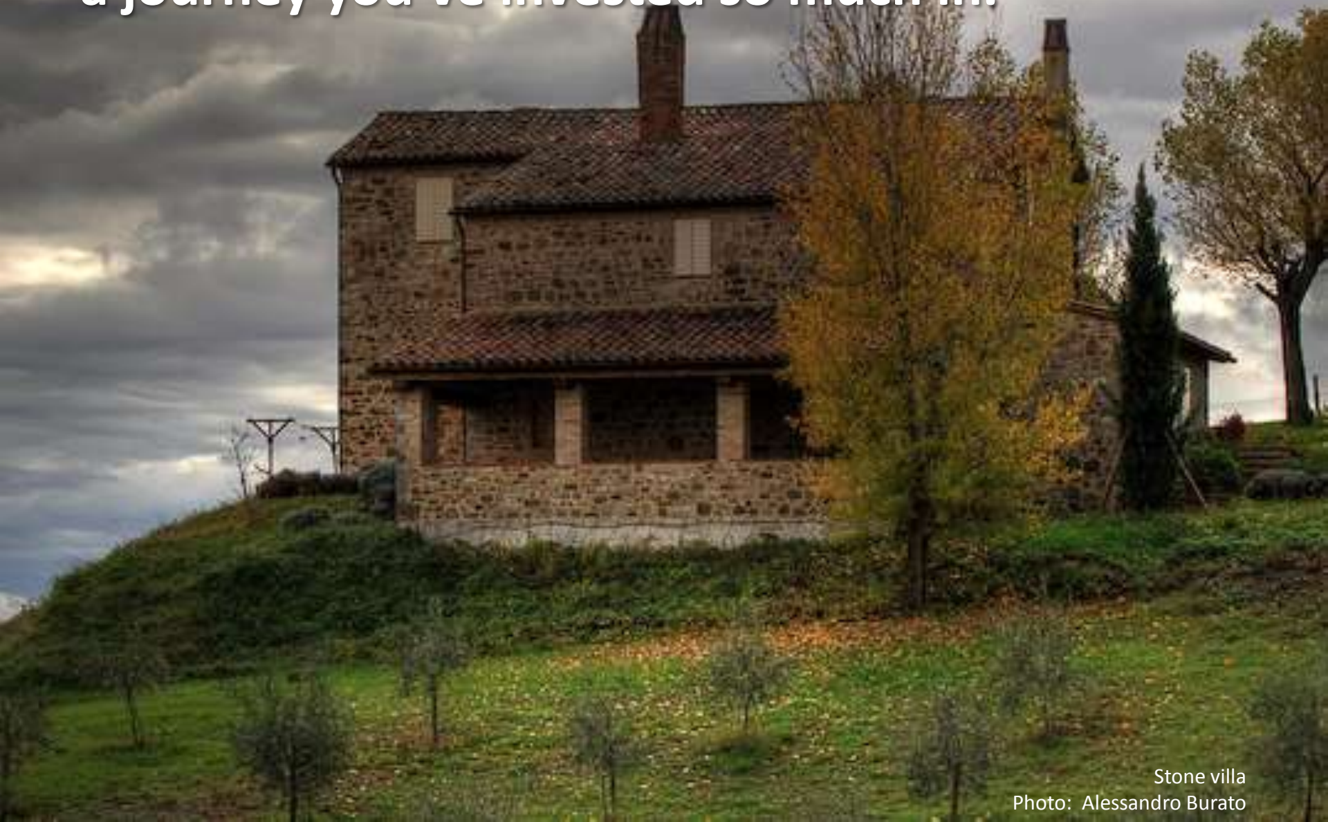
Stone villa

We believe you should enjoy every moment of a journey you've invested so much in.