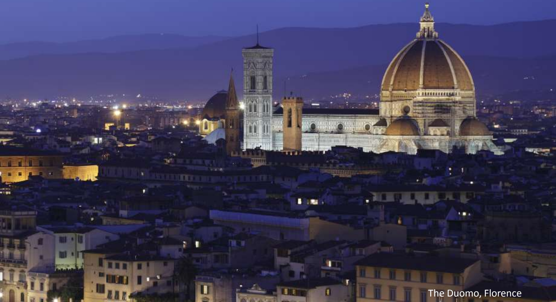
The Duomo, Florence