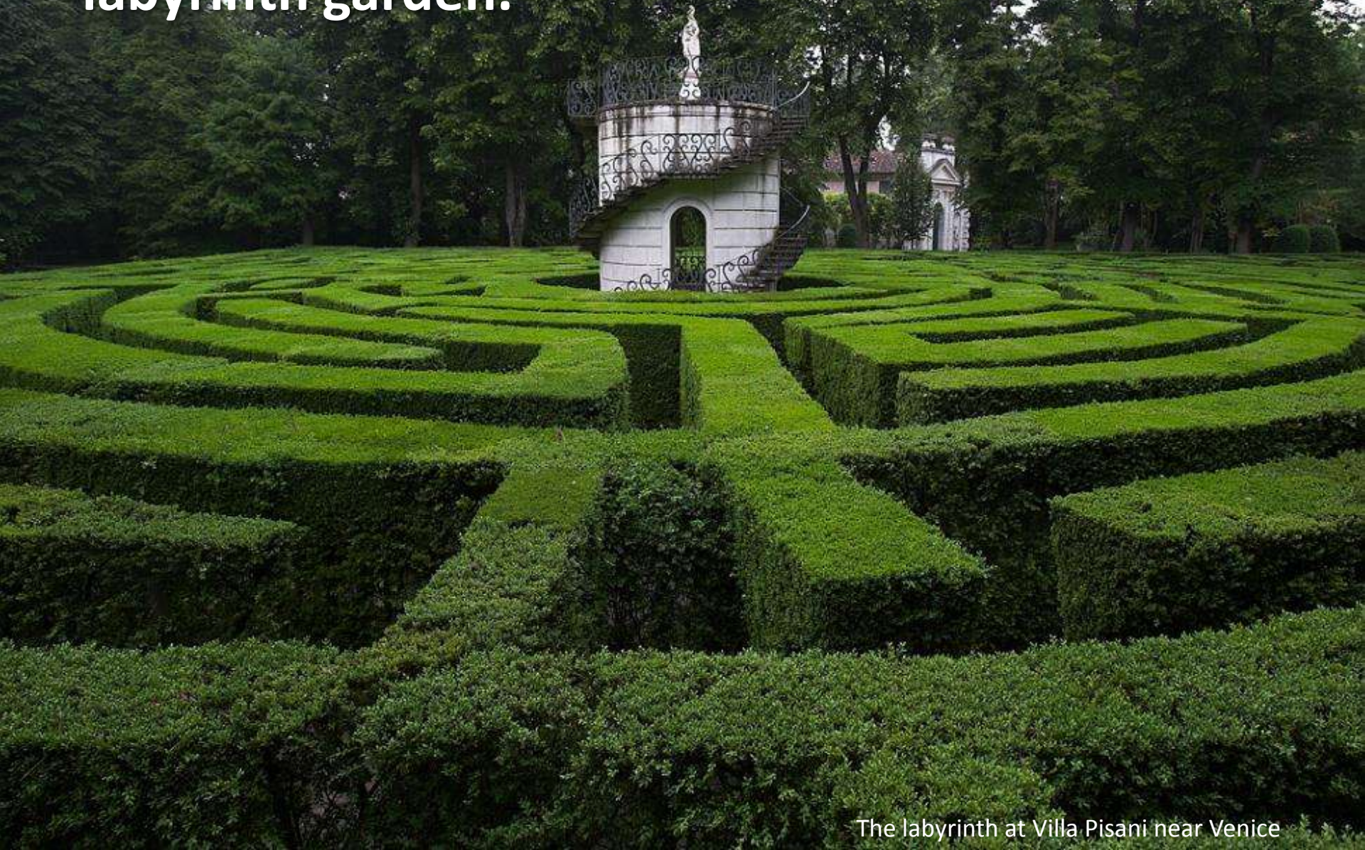
The labyrinth at Villa Pisani near Venice

Italy can be as gorgeous, and as deceptive, as a labyrinth garden.