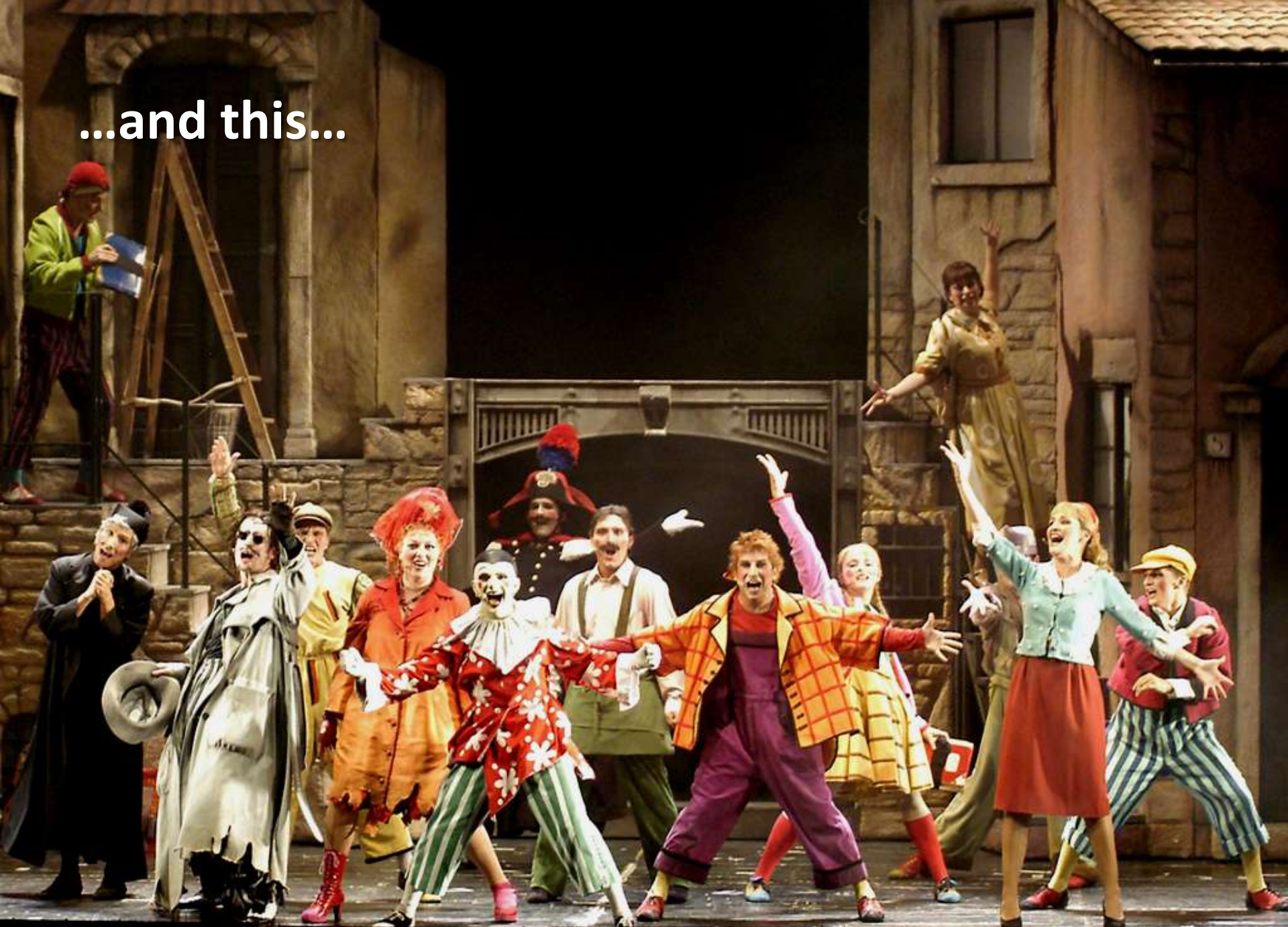
Pinocchio, the musical, Rome