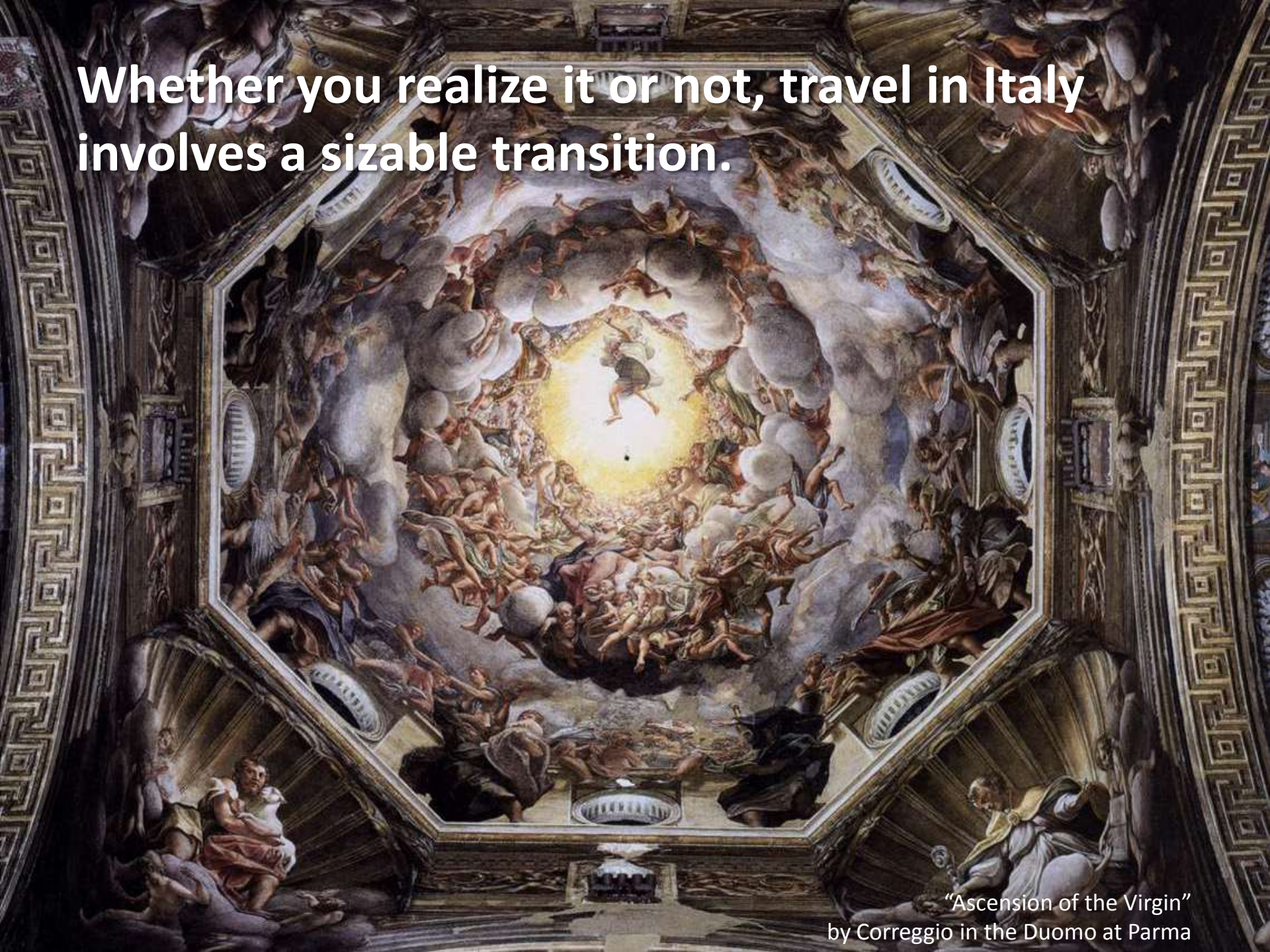
"Ascension of the Virgin" by Correggio in the Duomo at Parma

Whether you realize it or not, travel in Italy involves a sizable transition.