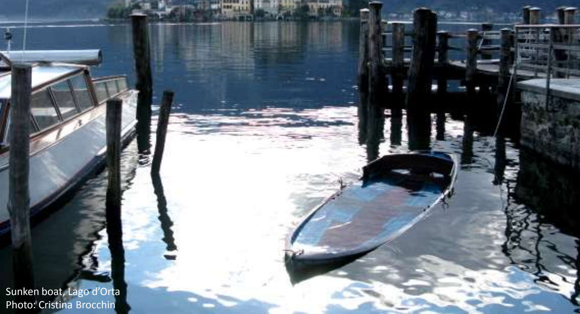
Sunken boat, Lago d'Orta

That's not even counting all the things in Italy that don't work the way they should.