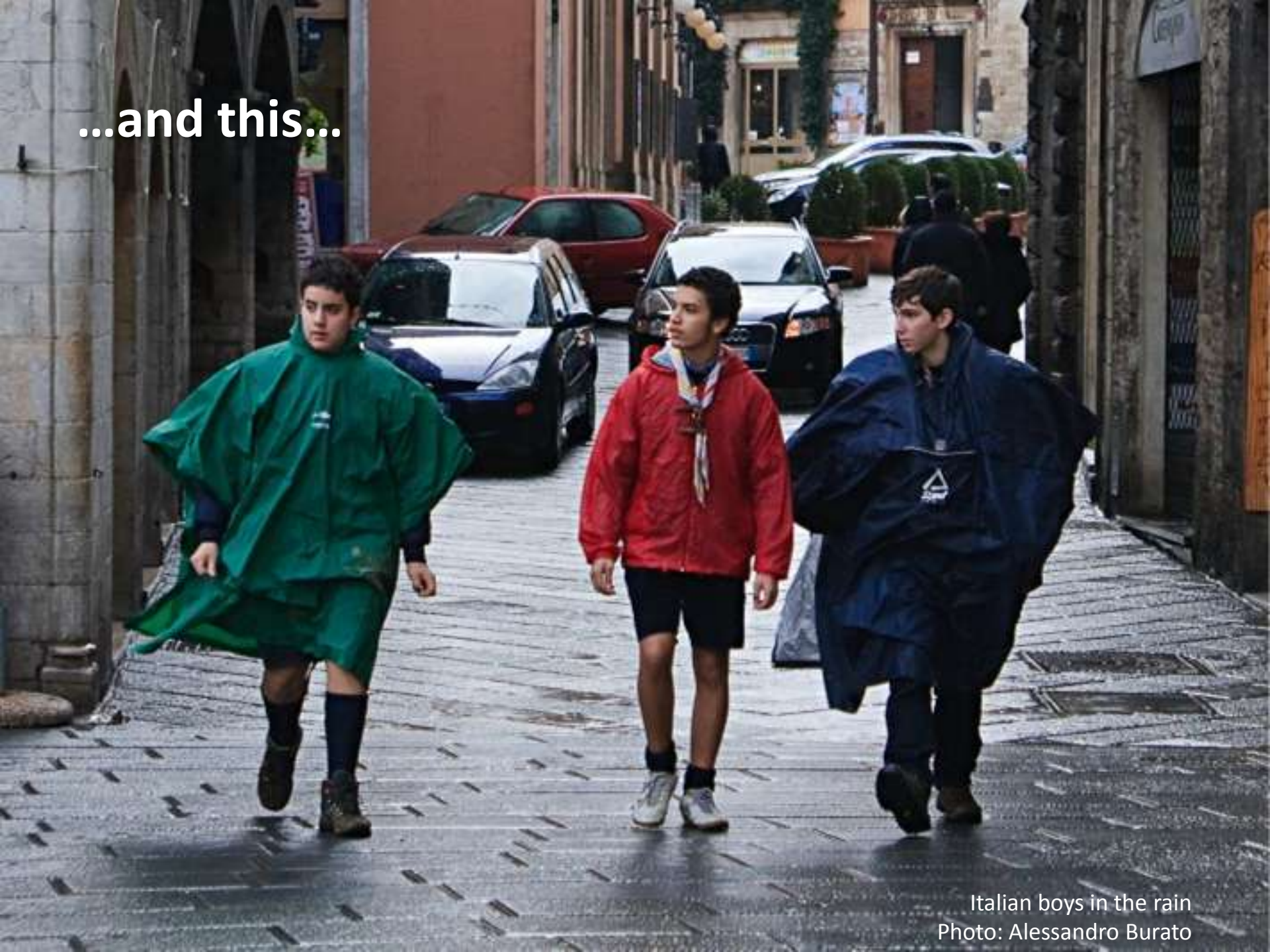
Italian boys in the rain