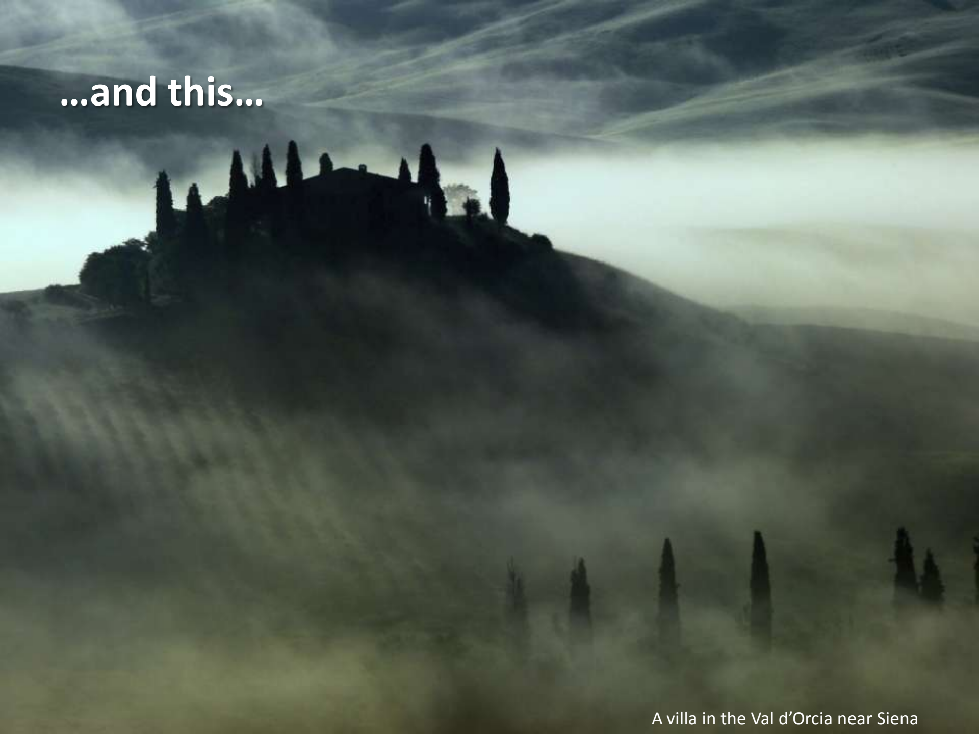
A villa in the Val d'Orcia near Siena