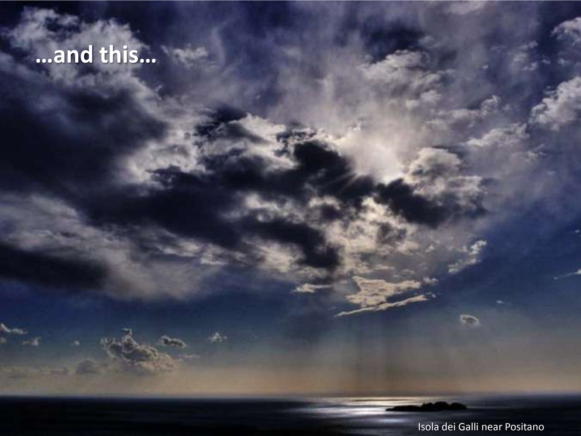
Isola dei Galli near Positano