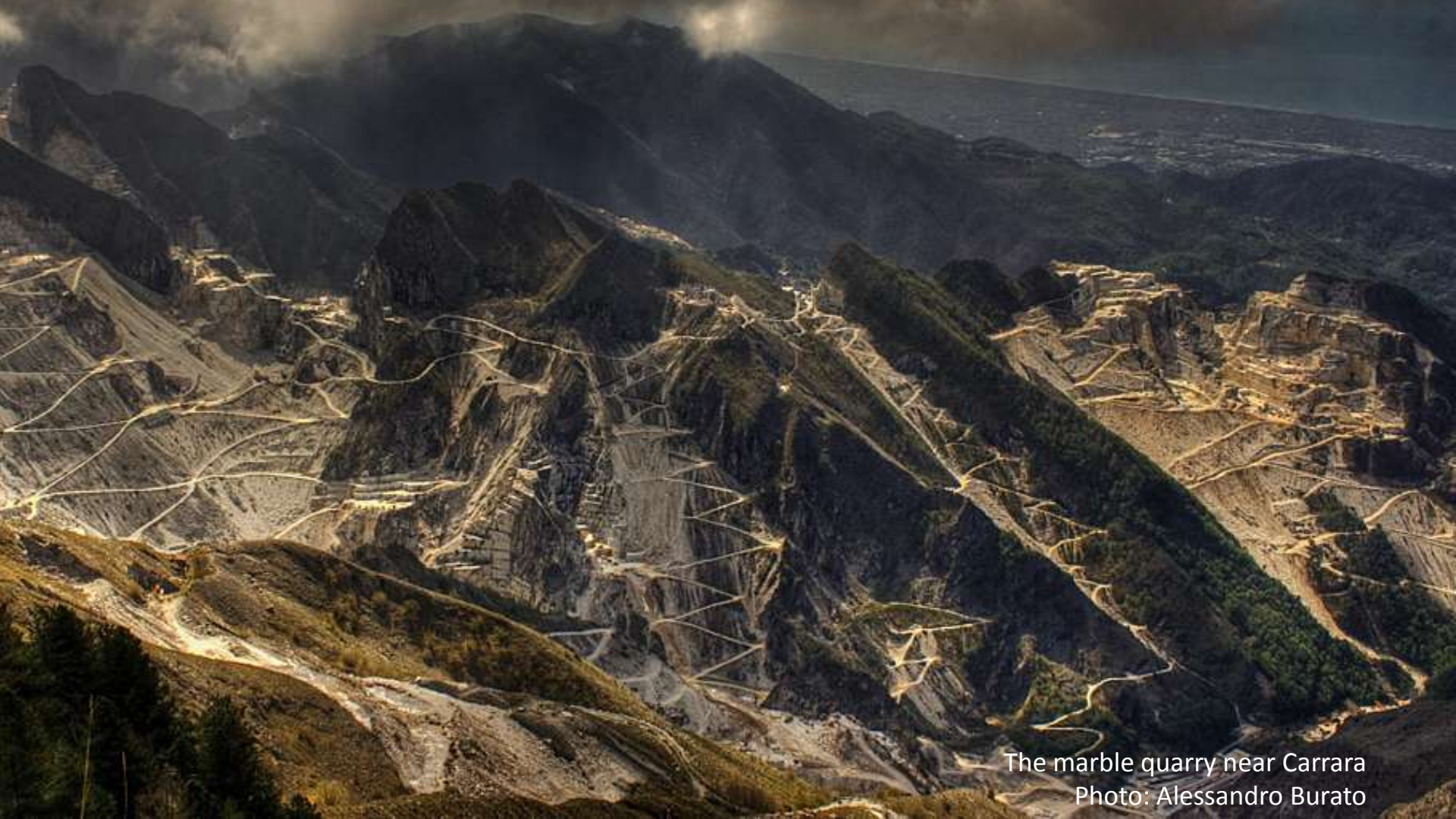
The marble quarry near Carrara

Wouldn't it be terrible to miss what is waiting in Italy simply because you weren't prepared?