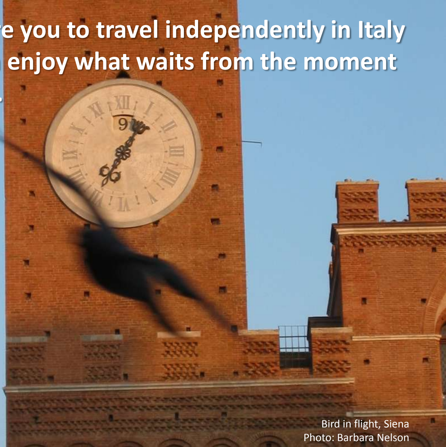
Bird in flight, Siena

We prepare you to travel independently in Italy so you can enjoy what waits from the moment you arrive.