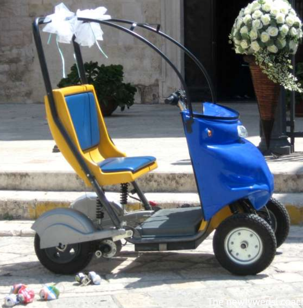
The newlyweds' coach in Polignano a Mare

You must change languages, food, cultures, time zones, where you sleep each night, even the way you travel.