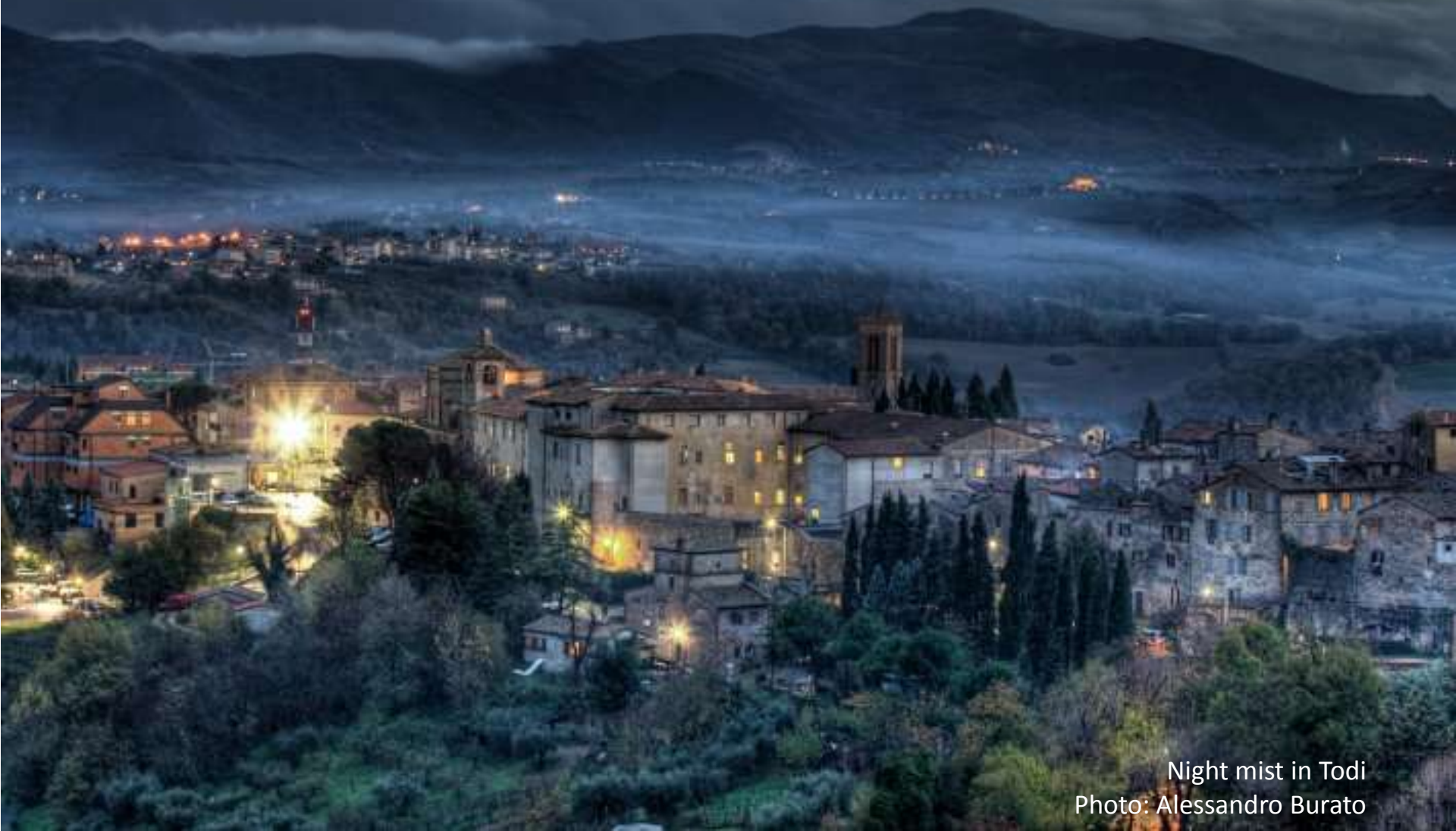
Night mist in Todi